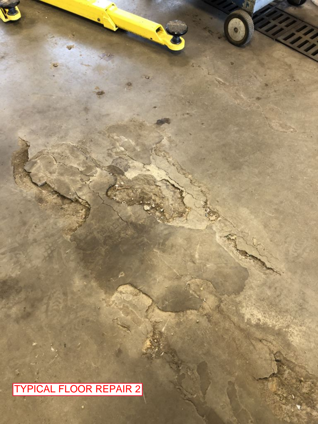
TYPICAL FLOOR REPAIR 2