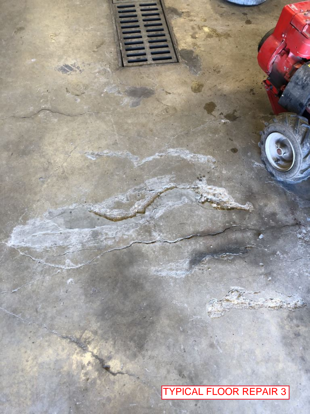
TYPICAL FLOOR REPAIR 3