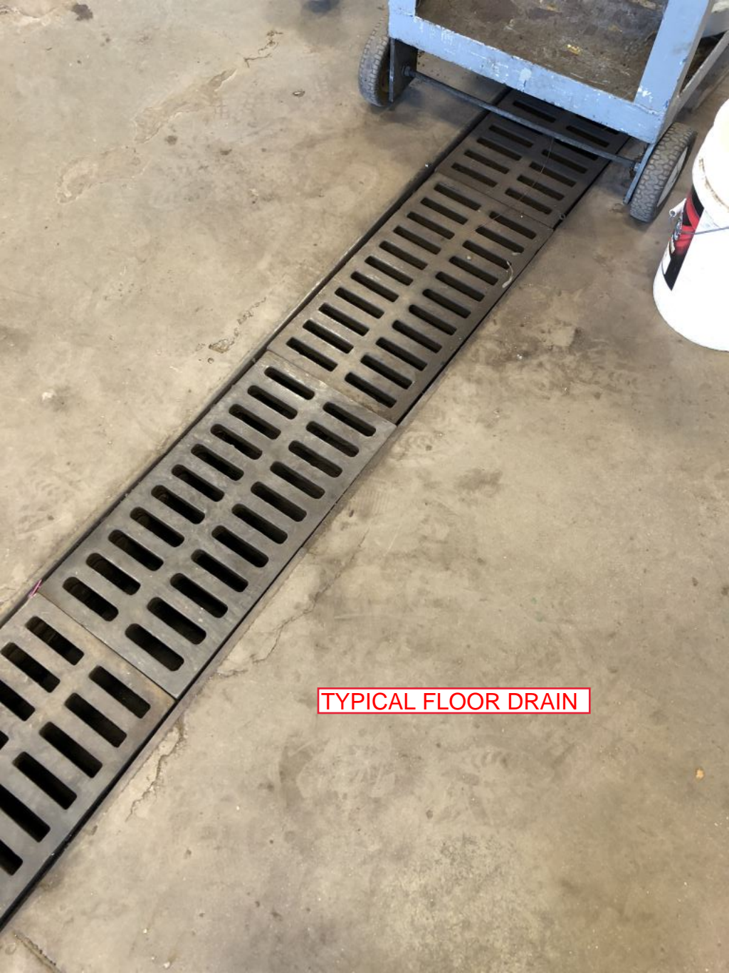
TYPICAL FLOOR DRAIN