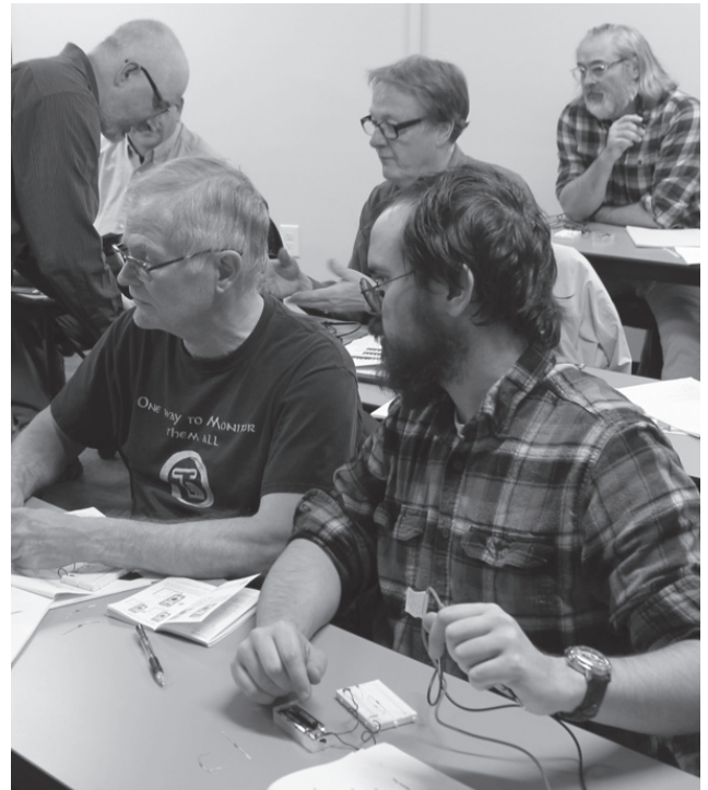
Circuit Electronics Class