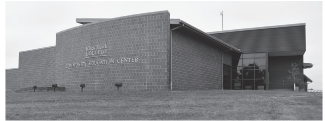
Community Education Center (CEC) - Kewanee

6 Wednesdays Apr. 2 - May 7 6:00 - 7:30 p.m. Kewanee CEC - Rm. 102 Fee $60 In-Person Class ID 2546 Last day for refund: Mar. 28